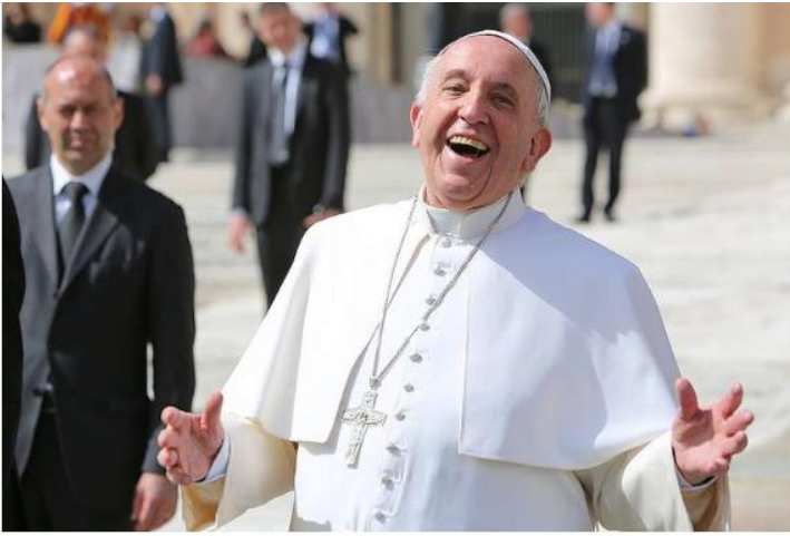
Pope Francis laughing outside of St. Peter's Basilica during the general audience on April 1, 2015.