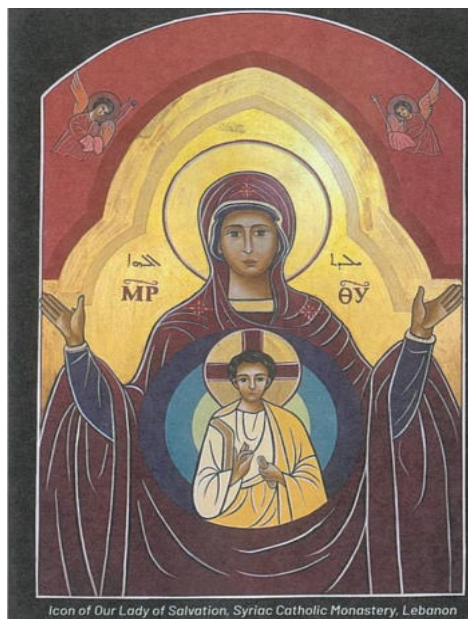
Icon of Our Lady of Salvation, Syriac Catholic Monastery, Lebanon