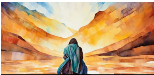
Jesus praying in the desert - 1st Sunday of Lent Year B