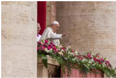
Pope Francis gives his urbi et orbi Easter blessing from the central loggia of St. Peter's Basilica on March 31, 2024.

Today throughout the world there resounds the message proclaimed 2,000 years ago from Jerusalem: "Jesus of Nazareth, who was crucified, has been raised!" (Mk 16:6).